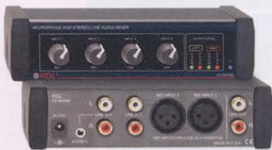
EZ-MX4ML mic/stereo line audio mixer - 4x1

23 "CONNECTORIZED" UTILITY MODULES FOR AUDIO & VIDEO